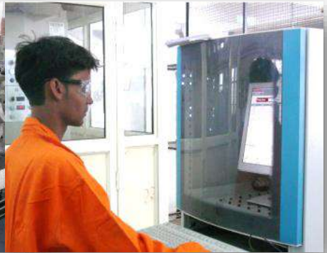
Desma Control Panel