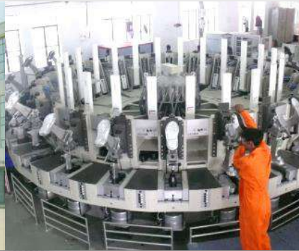
Desma (DIP) Machine